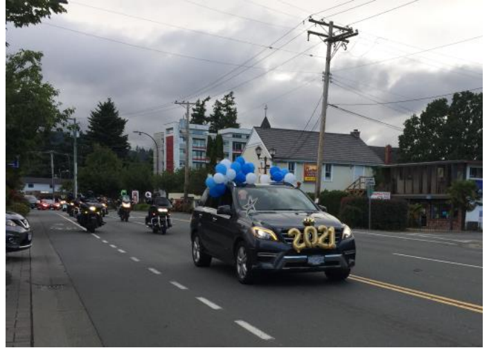
Belmont Grad 2021 parade in Langford. Congratulations to all the graduates!