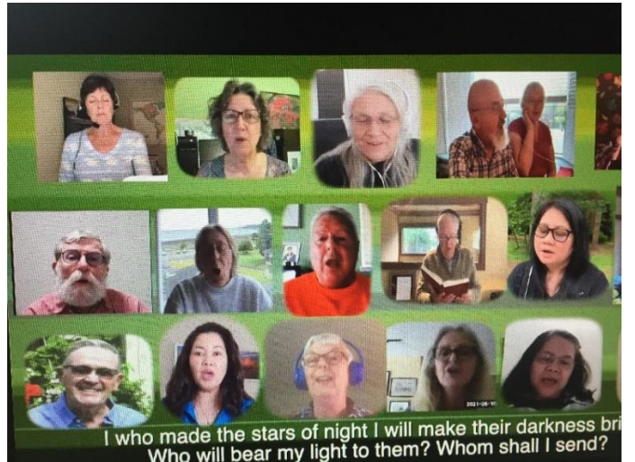
Virtual choir during the Worship service and Celebration of Ministry for the Pacific Mountain Region last Sunday