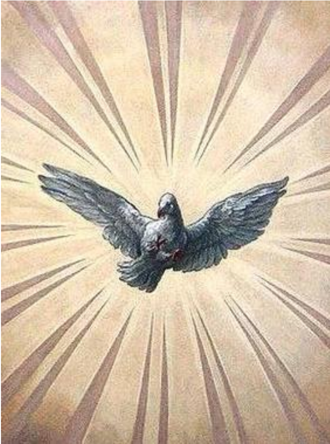
Fresco of the pentecostal dove (representing the Holy Spirit) at the Karlskirche in Vienna, Austria.

Pastoral Care pastoralcare@gordonunitedchurch.ca