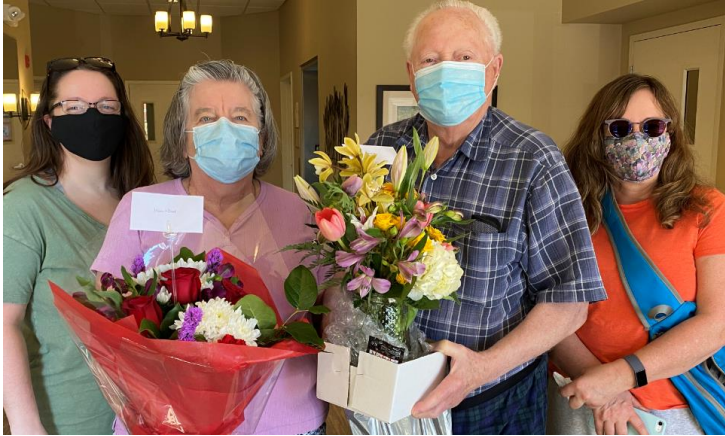
Flowers & a visit from their daughter & granddaughter.