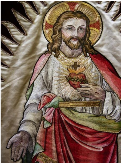
"Sacred Heart of Jesus" by Lawrence OP is licensed under CC BY-NC-ND 2.0